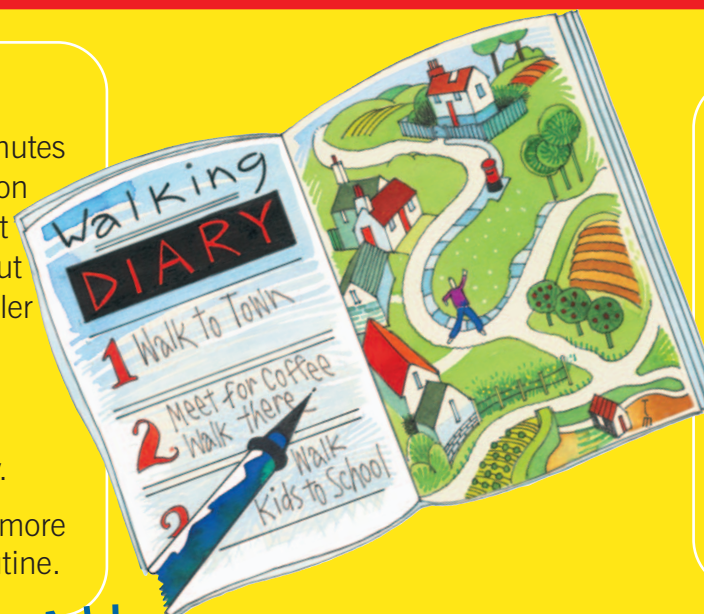
Add more steps to your day

Think of ways of getting more walking into your daily routine.