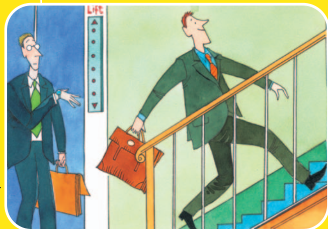
Take the stairs

Walk as if you are late for an appointment. You should be able to talk as you walk. If you can't do this then you are going too fast!